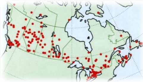
NAACJ and its Members across Canada